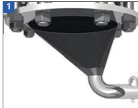
1 Standard Suction Hopper

The hopper is designed with a special discharge angle allowing full emptying of the equipment. The size is adapted on one side to the equipment to be discharged and on the other side to the required PTS model. The standard hopper is equipped with a fluidization filter allowing an optimal control of the powder flow.