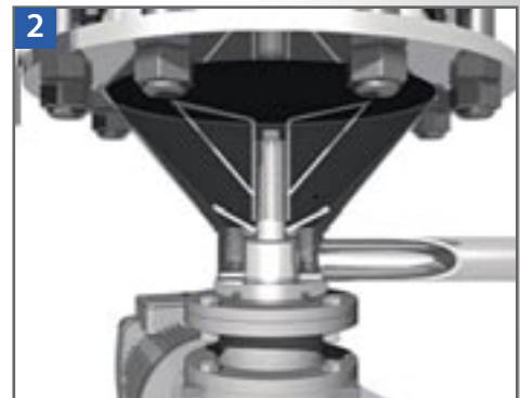
2 LB Hopper

The hopper is designed with a special discharge angle allowing full emptying of the equipment. The size is adapted on one side to the equipment to be discharged and on the other side to the required PTS model. The standard hopper is equipped with a fluidization filter allowing an optimal control of the powder flow.