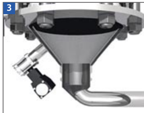
3 Fluidization Hopper

The LB Hopper, in combination with the PTS System, is the ideal solution for evacuating lumpy or compacted powder without changing its characteristics. It is equipped with a tool which breaks bridges and lumps to provide a constant powder flow. The system with its limited height is easily installed directly at the outlet of existing equipments such as dryers etc. with limited head space.