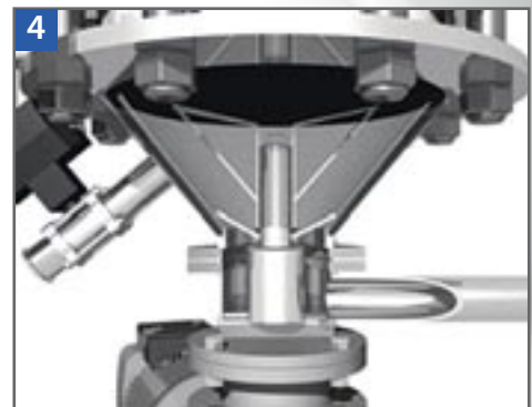
4 Fluidization Hopper with lump breaker

The hopper is equipped with a fluidization cone constructed of a special porous material. The product flow of sticky or non free-flowing powders is optimized by compressed gas which flows through the pores of the cone. Inert gas can be used in case of flammable products.