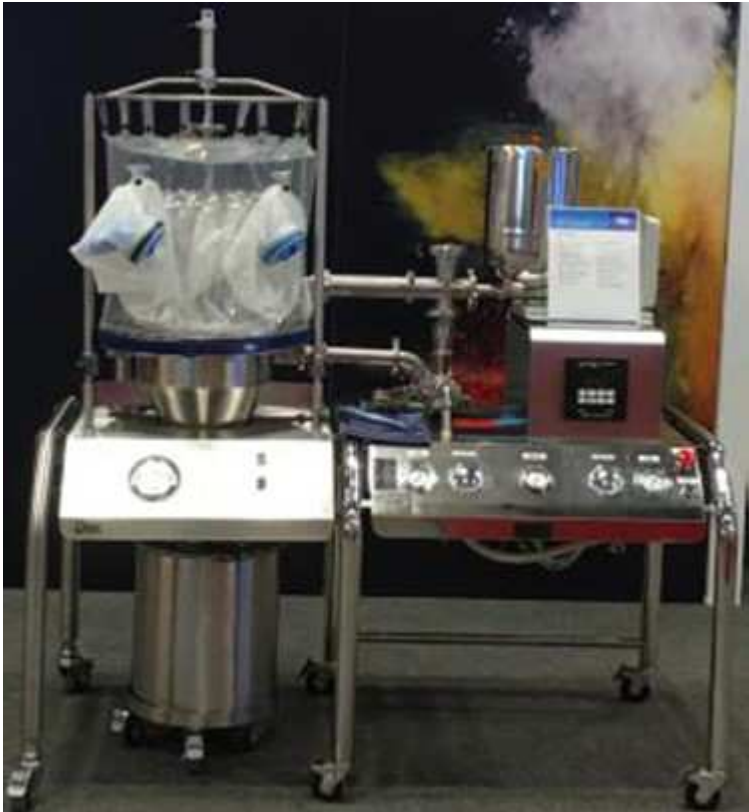
New 4th generation MC50 jet mill for laboratory and small scale production.