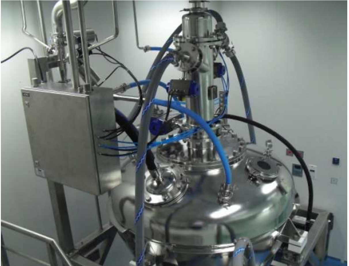
Dec PTS Batchmixer high containment powder mixing system