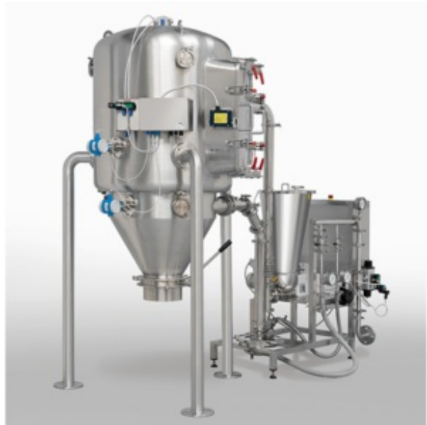
Dec MC DecJet® 200: moving to full jet milling production at 500g to 50 kg per hour