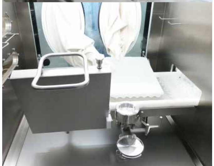
2 ppm = products per minute