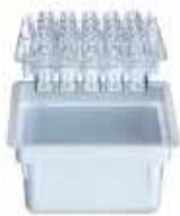
Nestled / RTU