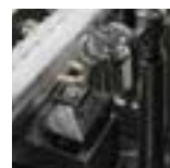
In Process Control